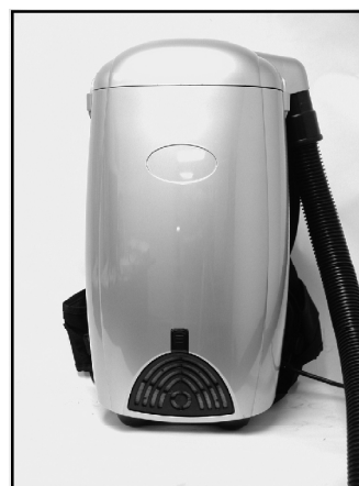
Reversible lid for right hand operation