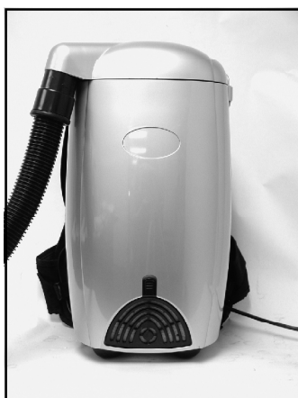
Reversible lid for left hand operation